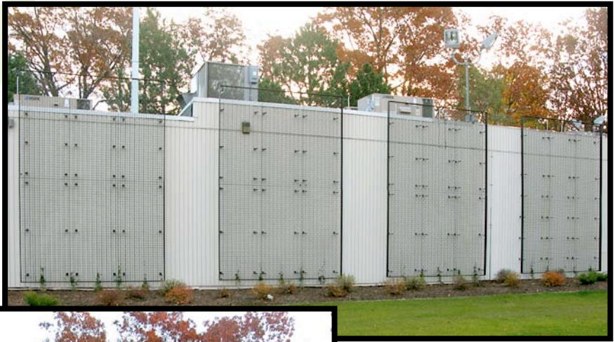
Hardiness Zone 6a

An industrial building with a pattern of split faced block and an adjacent mechanical equipment building of corrugated steel are decorated with greenscreen® wall mounted panels for vine cover.